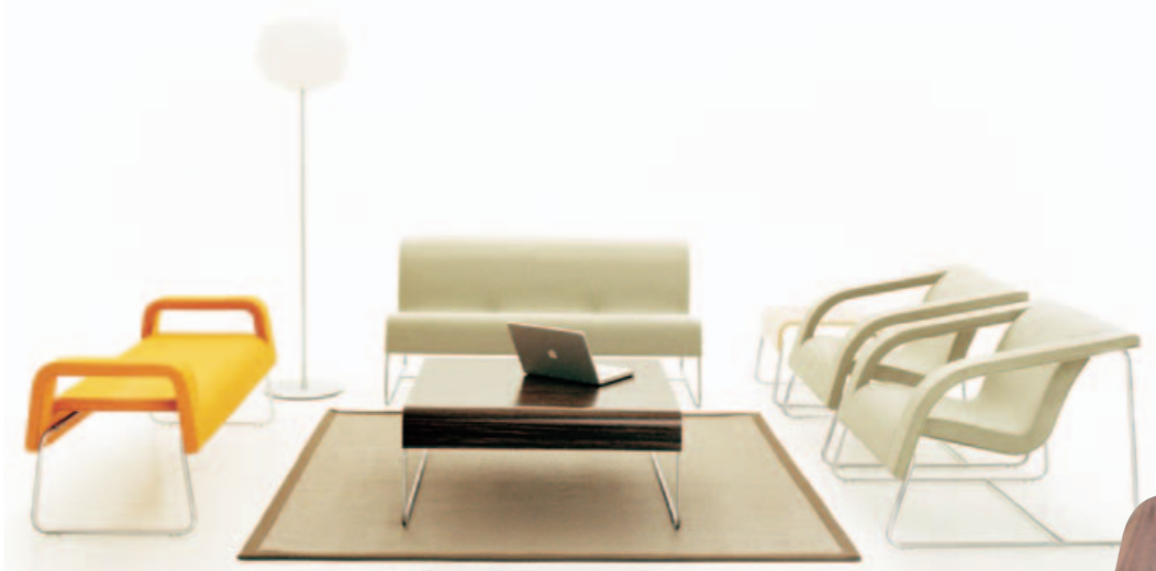
Pli Range from Bangdesign

The Pli furniture range by Bangdesign is an original design creation in collaboration with Formway Design using sustainable plantation-grown timber in a fluid and flowing form to show just how progressive eco design has become for the modern marketplace. Available in a great choice of colours, the Pli range includes a range of armchairs, ottomans and tables so you can group them together or use a single piece as a stand alone feature. Bangdesign is available in Queensland through Commercial Images, Ph: 07 3844 9100. www.bangdesign.com.au