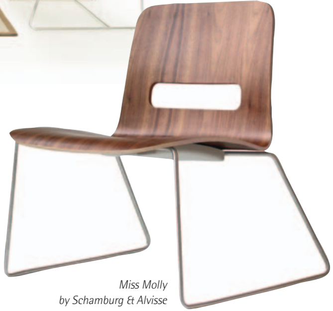
Miss Molly by Schamburg & Alvisse

So if you are like the growing number of design lovers turning their eye towards environmentally sensitive chic for the space we live in, look no further than our own shores for future-forward design that proves eco is where it's at.